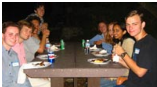
First-week social, featuring Korean BBQ, at the Sunset Recreation Center.

A whole quarter is over, and what does the activities committee have to show for it?