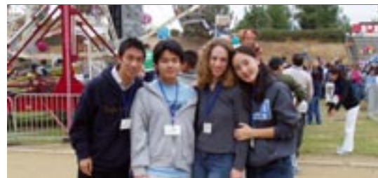
International Day of the Child.

Mountain, a fun and friendly game of bowling (practice for the not-so-friendly championship game spring quarter), a trip to see the Lakers at Staples, an excuse to relax after midterms at a first-ever RSS board-game night, a chance to show off your inner Michelle Kwan on our ice skating trip, and an opportunity to watch a taping of America's number one late-night host, Jay Leno. So, check your e-mails and don't miss out on all the great stuff ahead.