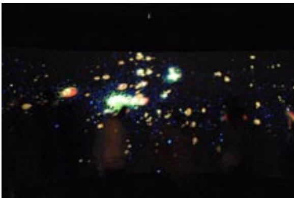
Students (ie: black blobs at the bottom of the picture) view the visualization screen with 3-D glasses as the "universe" changes with each progressive time step.

Winter Quarter will be packed full of events organized by the External Affairs Committee. Most notably, Warren Christopher will be our luncheon guest.