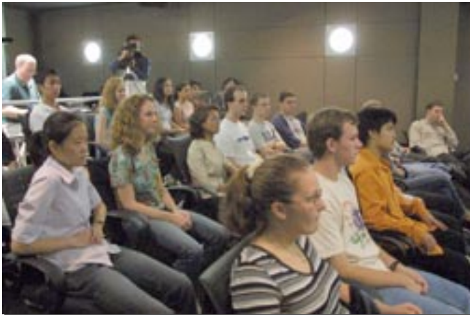
Every seat was filled at this year's first seminar.