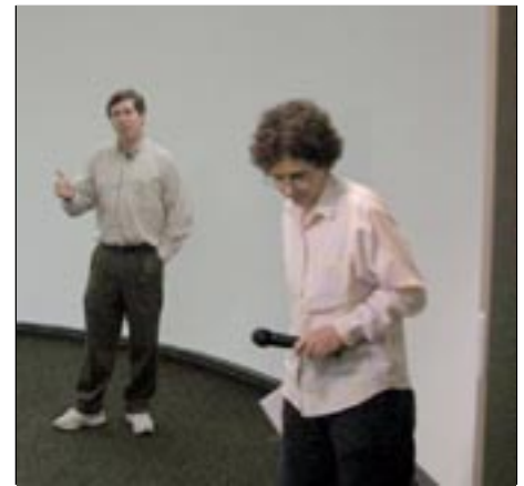
Lecturers of the astronomy department have been studying matter of the universe and how to model it on computer.

We will also have a seminar, which could be anything from a discussion on current events to a private museum tour. Dinner with the Faculty promises